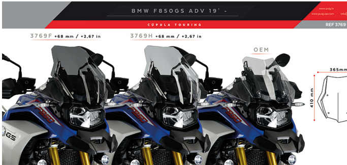
OEM Sport Windshield